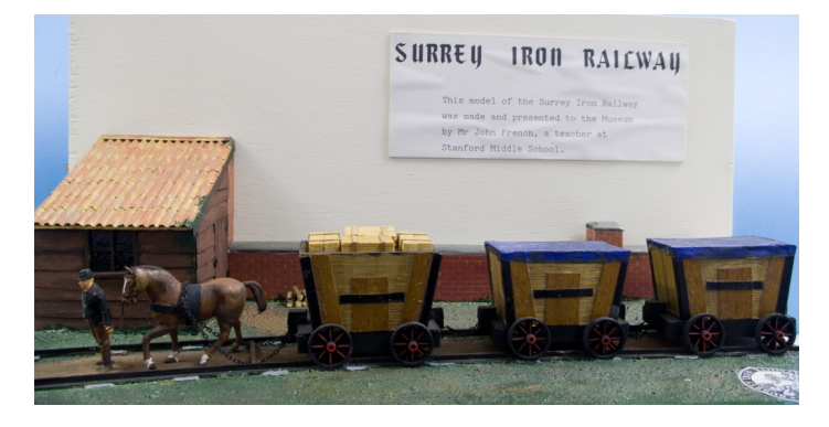
A model of the Surrey Iron Railway at the museum.

The Surrey Iron Railway was not the first public railway, there were others, but it was the first authorised by Parliament, which makes it unique. It was officially opened on 26<sup>th</sup> July 1803 but complete construction had not been finished and two more acts were needed to raise sufficient money to complete the project, one on 12<sup>th</sup> March 1805, and another on 3<sup>rd</sup> July 1806.