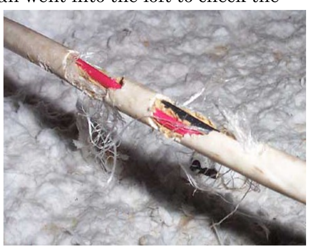
This shows the type of damage a squirrel causes to wiring.

wiring. As I stood under the loft hatch I could hear him say — "I don't believe it", "Oh no", "What the heck" and a few other words. The squirrels have chewed through every cable within the loft. Making a call to his boss he was advised that the electricity had to be cut off from the fuse box. There was a danger of the wires shorting and causing a fire. We certainly didn't want that. This means that currently the museum has no lighting and no heating.