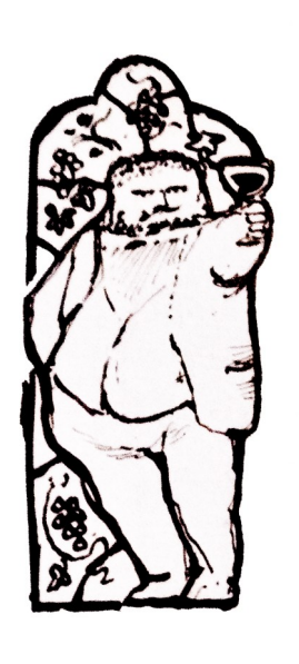
A drawing of William Morris.

There was a drawing at the start of the exhibition – "Going to the Battle". No bigger than 10x8 inches it included a high level of detail in the picture. This included minute windmills, hay stacks, churches, viaducts, trees and people to the detail of the dresses the ladies in the foreground were wearing. None of the later work shown in the exhibition appeared to include this type of minute detail. This could be due his commercial undertakings for Morris & Co and the need to fulfil commissions.