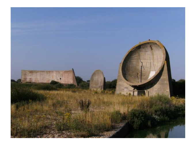
The Sound Mirrors at Denge.

May 1918, but there was a need to detect lower frequency sounds, so bigger mirrors were built. A 200ft mirror was built in Malta, but plans for a bigger mirror at Fan Bay were never fulfilled.